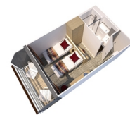
Double-occupancy cabin, separable beds